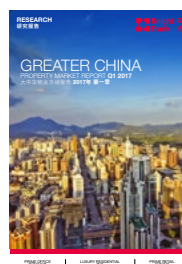
Greater China Property Market Report Q1 2017

© Knight Frank 2017 - This report is published for general information only and not to be relied upon in any way. Although high standards have been used in the preparation of the information, analysis, views and projections presented in this report, no responsibility or liability whatsoever can be accepted by Knight Frank for any loss or damage resultant from any use of, reliance on or reference to the contents of this document. As a general report, this material does not necessarily represent the view of Knight Frank in relation to particular properties or projects. Reproduction of this report in whole or in part is not allowed without prior written approval of Knight Frank to the form and content within which it appears.