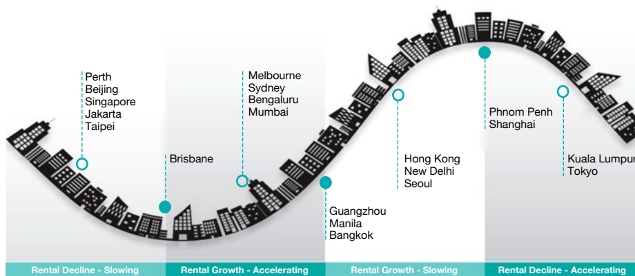
FIGURE 3 Prime Office Rental Cycle

^ Based on net floor areas for except for China, India, Korea, Taiwan, Thailand (gross) and Indonesia (semi-gross) ** Inclusive of incentive, service charges and taxes. Based on net floor areas.