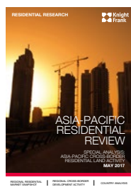
Asia-Pacific Residential Review 2017