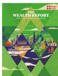
The Wealth Report 2017